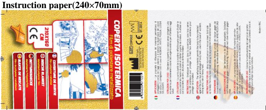
Out carton two long sides priting